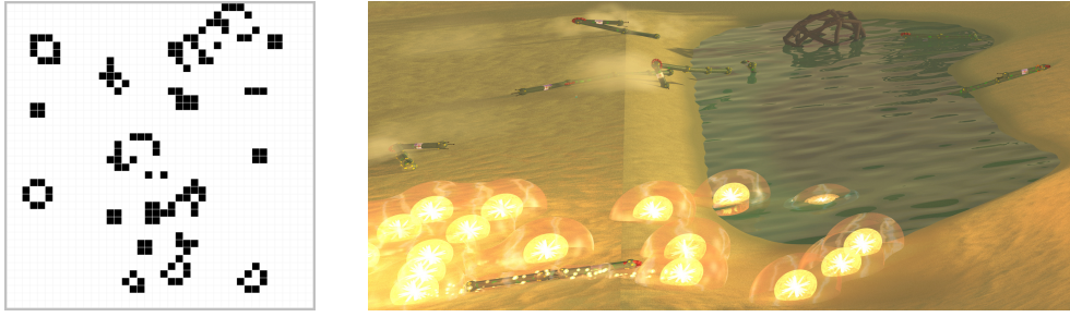
Figure 3: Left: a sample two-dimensional cellular automaton of size 40x40; cells are squares, each cell in this example can have one of two states (shown as white and black). Right: a simulation of three-dimensional creatures, Framsticks [40, 41], moving and interacting with virtual sources of energy.